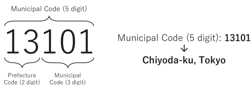
Figure 2 Structure of Municipality Code (5 digit)

Notes: Prepared by the author based on the information from Statistics Bureau, Ministry of Internal Affairs and Communications (2023). The base date of the annual data is as of October 1 of the census. Six villages in the Northern Four Islands are not included in the above figures because population censuses are not conducted there.