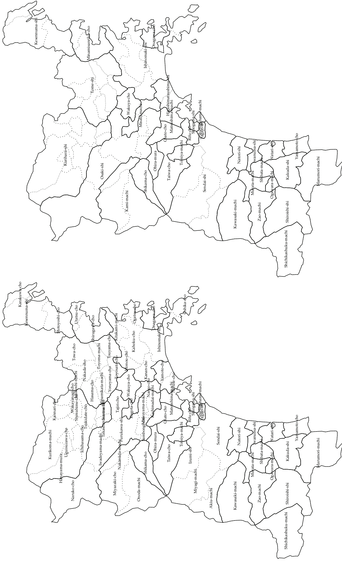
(a) Municipal Names as of 1980