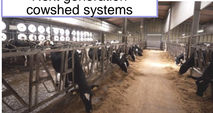
Next generation cowshed systems