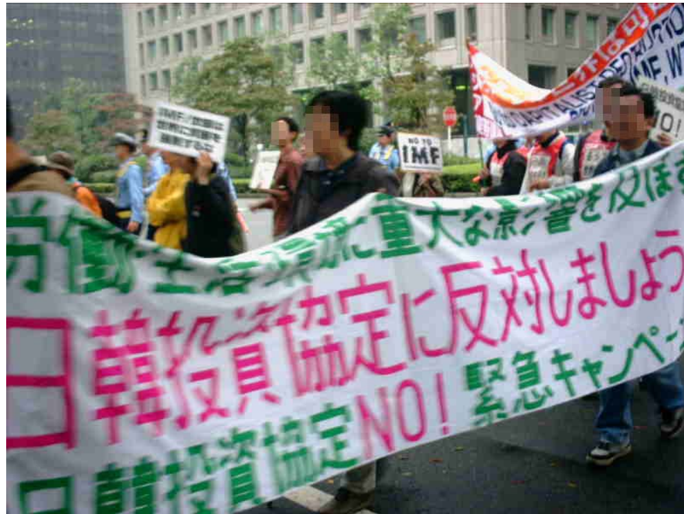
“Down with a Nippo-Korean BIT!”

“The treaties [BITs] emphasise liberalization and protection of foreign investment. They uniformly discard concern about environment and human rights. This is despite the fact that multinational corporations which take foreign investment into developing countries are known to do so because environmental standards and human rights standards are lax in these countries.” (M. Sornarajah, “A law for need or a law for greed?” International Environmental Agreements , vol. 6, 2006, p. 329, p. 338.)