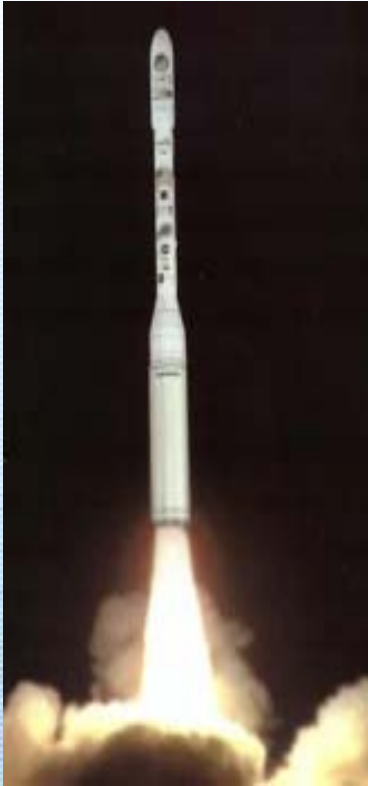
The Man-made Satellite 'ARIRANG'