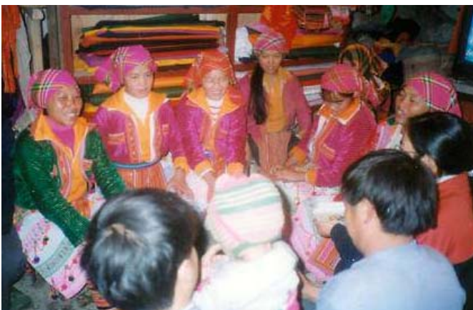
Women attending their weekly repayment group meeting in a small village of Malipo county (Yunnan).

This campaign has been conducted in the framework of a 18-month project sponsored by the European Commission EU-Asia IT&C programme. From September 2003 to July 2004, 37 organisations in 11 provinces, from Central Asia to the Vietnamese border were provided with IT equipment and training.