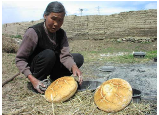
One of the first clients of Huanyuan programme in Qinghai. Baking bread under the sky is her main source of income.

Another 6 organizations were provided with USB memory stick and email accounts and learned how to use them through distance-learning tools (CD-Rom).