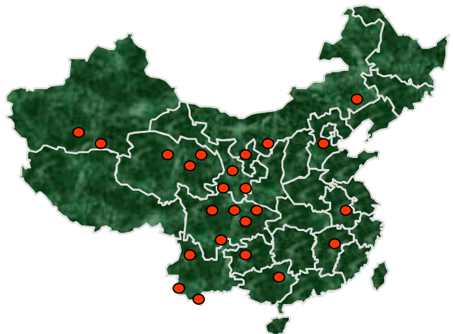
● Equipment Delivery Sites

Through providing IT&C equipment and training to microfinance programmes, the campaign contributed to bridge the digital divide. Indeed, microfinance staff's key role within the communities put them in a privileged position raise their clients' interest in the use of computers (to get market prices, learn new skills,...), provide them training and ongoing support.