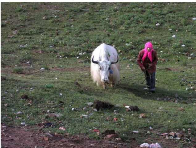
A client of Huanyuan county, in Qinghai province, one of the poorest areas of Western China.

This campaign, raised grassroots microfinance programmes' interest in learning from other experiences, increasing their financial/operational transparency and communicating about their own action within and outside China.