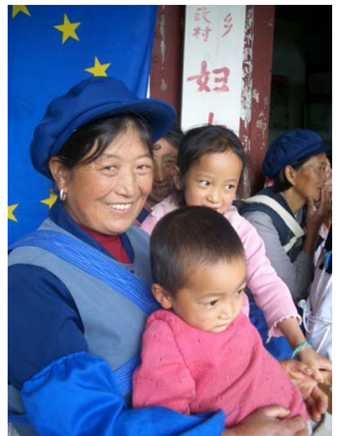
A client of the MF programme in Yulong county (Yunnan) at the equipment delivery ceremony

Today most rural programmes benefit from low-cost fixed phone: therefore, if they have a PC and know how to use it, they can easily connect analogue internet service. This Equipment Delivery campaign provided them with tools and knowledge to take advantage of this situation.