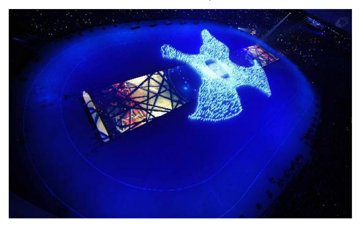
Beijing, China November, 6