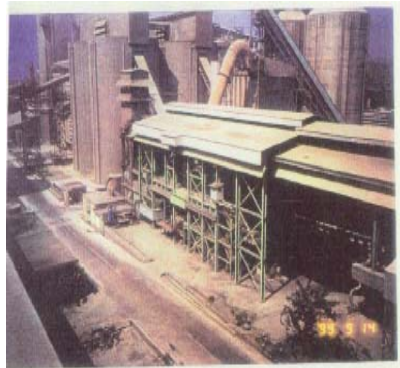
写真 - 22) P7 Cooler & Kiln, Cooler E.P and Clinker Silo(s)