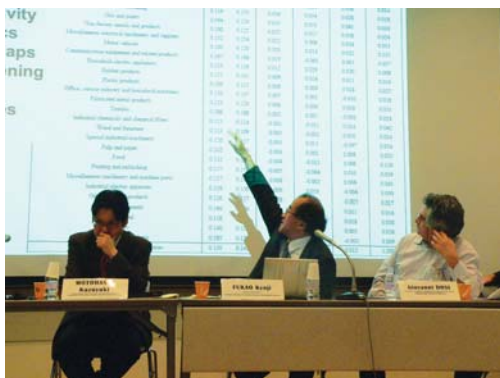
A-5) The Frontier of Corporate Governance Analysis: Economic Analysis of M&A and Corporate Governance MFJ-RIETI-WASEDA International Conference "Organization and Performance: Understanding the Diversity of Firms" (2008/11/14)