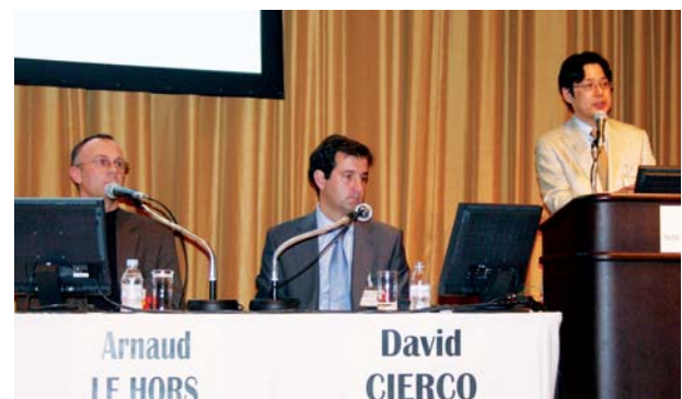
I-3) Empirical Analyses Relating to IT and Productivity OECD-METI-RIETI Conference "Innovation in the Software Sector" (2008/10/06)