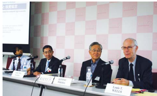
III-9) The Desirable Form of Legal Protection for Overseas Investments RIETI International Seminar "Investment Risk and International Investment Agreements" (2008/07/25)