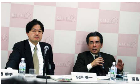
A-10) The "Enterprise Law" as an Infrastructure for the Incentive Bargain of the Firm RIETI Seminar "Enterprise Law as the Infrastructure of an Incentive Mechanism: Implications for New Japanese Corporate Governance System" (2009/02/05)

"Universities of the Future from Social and Economic Perspectives" (2008/05/30)