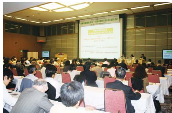
A-7) Reform of Labor Market Institutions RIETI Policy Symposium "Labor Market Institutions Reform in Japan" (2008/04/04)