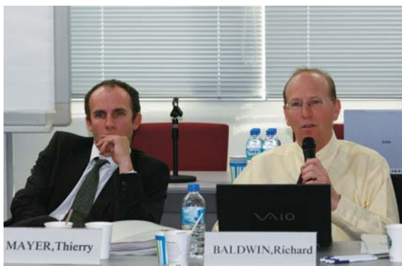
III-14) Study on International Trade and Firms CEPR-RIETI International Workshop "Internationalization of Firms and Trade: A Comparison between Japan and Europe" (2009/03/27)

Events occurring during 2008 and 2009 point to the advent of the most significant juncture in the restructuring of the international order since the end of the Cold War. These events include the launch of a new U.S. administration, changes taking place in China since the Beijing Olympics, and the resurrection of Russian diplomacy in the sphere of its influence. On the other hand, Japan's efforts to restructure its domestic order have lost speed and momentum after the Koizumi reforms, and Japan can be expected to continue to experience turmoil in its internal politics for some time to come. While Japan will have to engage in more fundamental discussions once the internal turmoil has settled, there is a need to analyze the ongoing changes in the international environment and to adopt diplomatic policies that correspond to these changes. This project suggests that the global international order has entered a period of change during 2008 and 2009, and seeks to identify the essential features of this change. The project also considers, on a very fundamental level, the question of how Japanese diplomacy should respond to these changes. Efforts will be made to formulate recommendations on practical policy issues as needed. (We believe that substantial discussion of changes occurring in the East Asian circumstances will become possible after the second half of 2009.)