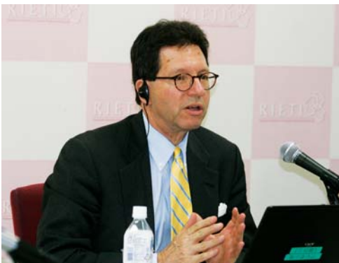
III-8) The Rise of China and the Transformation of the East Asian Regional Order RIETI International Seminar "The Future of U.S.-China Economic Relations" (2008/05/28)

"Investment Risk and International Investment Agreements" (2008/07/25)