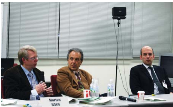
I-2) Building a New Macroeconomic Model and Policies in Times of Economic Crisis CEPR-RIETI Workshop "Labor Markets and the Macroeconomy: Theory, Evidence and Policy Implications" (2008/12/19)

As Japan experiences the aging of its society at a pace unprecedented worldwide, it is essential to build a sustainable social security system that ensures that the elderly do not suffer a decline in quality of life. Our research transcends the bounds of the traditional field-specific approach that addresses the health care, long-term care, and pension fields separately, and of simulation analysis with the use of macro models, and instead adopts a "new" microscopic yet comprehensive, market-oriented approach that is premised on the diversity of the elderly. Based on pilot studies already conducted in previous years, and with the intellectual support of the analogous studies of the elderly (the U.S. HRS [Health and Retirement Study], ELSA [English Longitudinal Study of Ageing] in the UK, and SHARE [Survey of Health, Ageing and Retirement in Europe] in Continental Europe), our research has inaugurated a world-standard panel study on population aged over 50. We are gathering data that is both multi-faceted, covering such aspects as health condition, economic situation, family relationships, employment status, and social participation, and that is also capable of international comparison. Our intention in doing this is to help ensure that "evidence-based policy-making" based on an abundance of microdata becomes an established feature in the sphere of social security policy in Japan, and that Japan's experience can be taken advantage of by other countries in their policy-making.