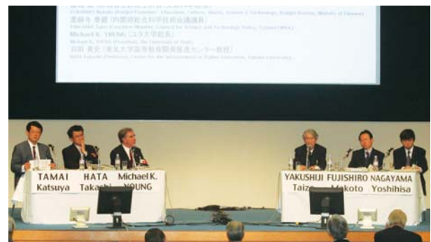
A-11) Universities of the Future from Social and Economic Perspectives RIETI Policy Symposium "Universities of the Future from Social and Economic Perspectives" (2008/05/30)