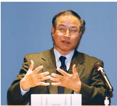
II-10) Study on Industrial Clusters KIER-RIETI Symposium "Innovation and Human Resources Development" (2009/01/16)