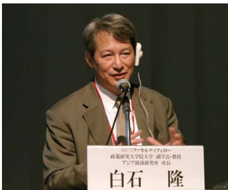
"The 8th Japan-China Economic Conference" (2008/11/18)