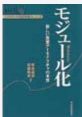
ISBN4-492-39370-6 Modularity: A New Industrial Architecture 2002/2 Written and edited by Masahiko AOKI and Haruhiko ANDOH