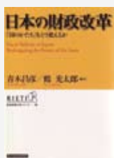
ISBN4-492-39435-4 Fiscal Reform of Japan: Redesigning the Frame of the State 2004/12 Written and edited by Masahiko AOKI and Kotaro TSURU