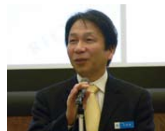
RIETI Policy Symposium Japan's financial system: Revisiting the relationship between corporations and financial institutions (2006/2/16-17)