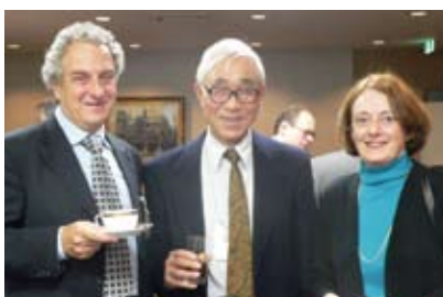
RIETI Policy Symposium Japan's pension system—Evaluating the 2004 reform and establishing clear principles for further reforms (2005/12/15-16)

<RIETI Economic Policy Analysis Series> Economic analysis of labor market design: Enhancing the job-matching function (Yoshio HIGUCHI, Toshihiro KODAMA and Masahiro ABE)