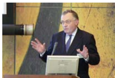
RIETI Policy Symposium Global management and innovation of Japanese enterprises—The strengths of global management and further challenges (2006/1/26)