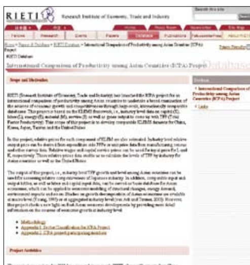
ICPA project top page on RIETI website