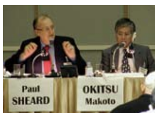
RIETI-CEPR Conference Corporate finance and governance: Japan-Europe comparisons (2005/9/14)

Corporate value creation through the strengthening of intellectual asset management