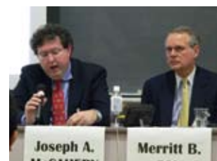
RIETI-CARF Policy Symposium What financing mechanisms and organizations of business entities best facilitate innovation? (2006/2/28)