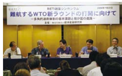
RIETI Policy Symposium "Prospects for the Doha round—Major challenges in the multilateral trading system and their implications for Japan" (2005/7/22)

<Discussion Paper> Technocracy in Indonesia: A preliminary analysis (Takashi SHIRAISHI) Changing roles of economic technocrats in the "small country" Malaysia (Takashi TORII)