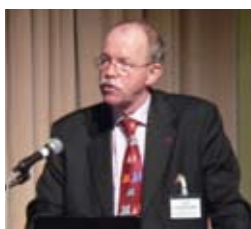
RIETI Policy Symposium Corporate value creation through the strengthening of intellectual asset management (2005/11/30)