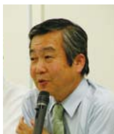
RIETI Policy Symposium Lifecycle of small and medium enterprises and revitalization of the Japanese economy (2005/6/23)

Licensing or not licensing?: Empirical analysis on strategic use of patent in Japanese firms (Kazuyuki MOTOHASHI)